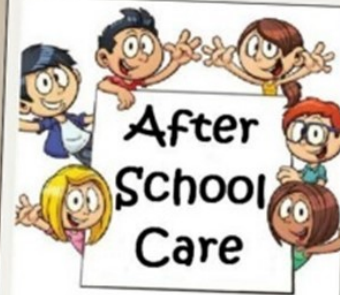
Available for Additional Cost