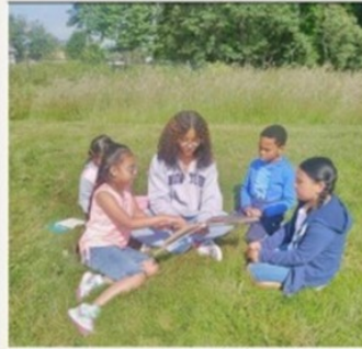
COMPREHENSIVE ACADEMIC SUPPORT