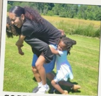
SOCIAL EMOTIONAL LEARNING